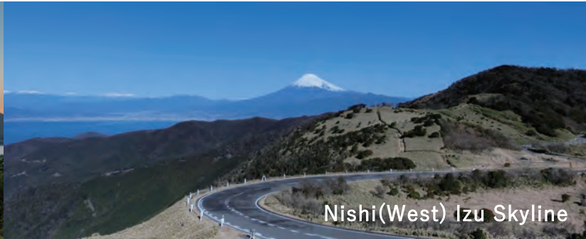
Nishi(West) Izu Skyline