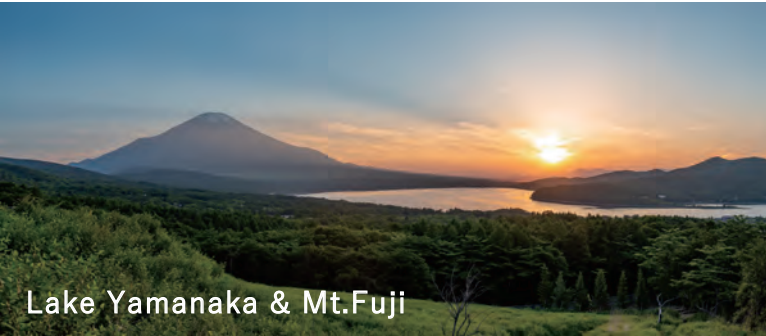
Lake Yamanaka & Mt.Fuji